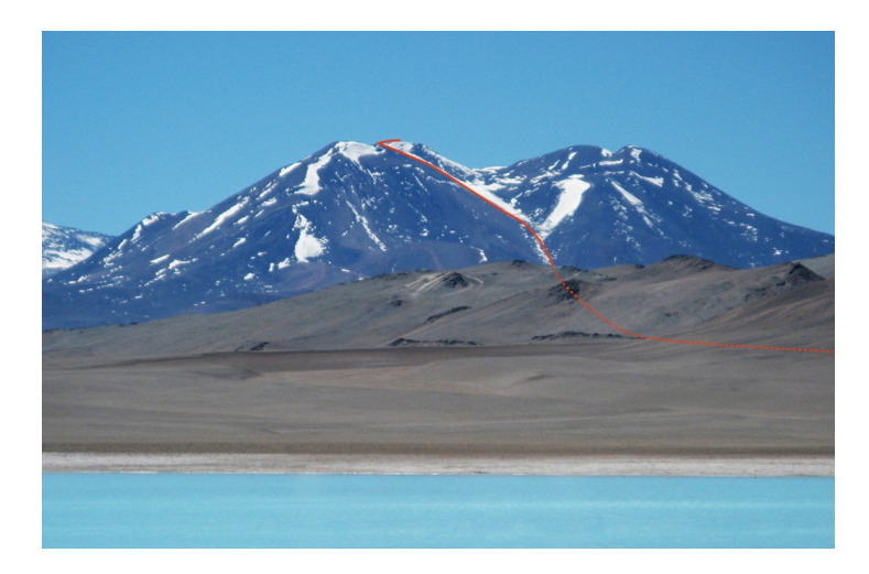
The route up Cerro del Nacimiento's south face.