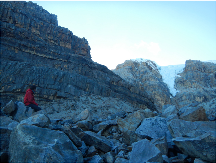
On the approach to Corredor Tropical.