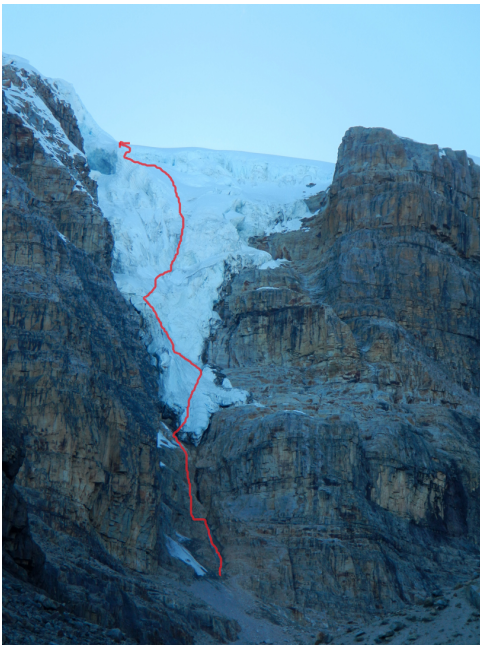
The line of Corredor Tropical.