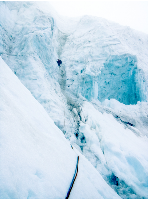
Leading a steep pitch of glacial ice on Corredor Tropical.