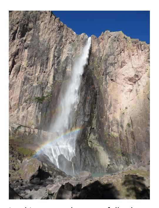
Looking up at the waterfall, where steep and difficult routes ascend the left wall.