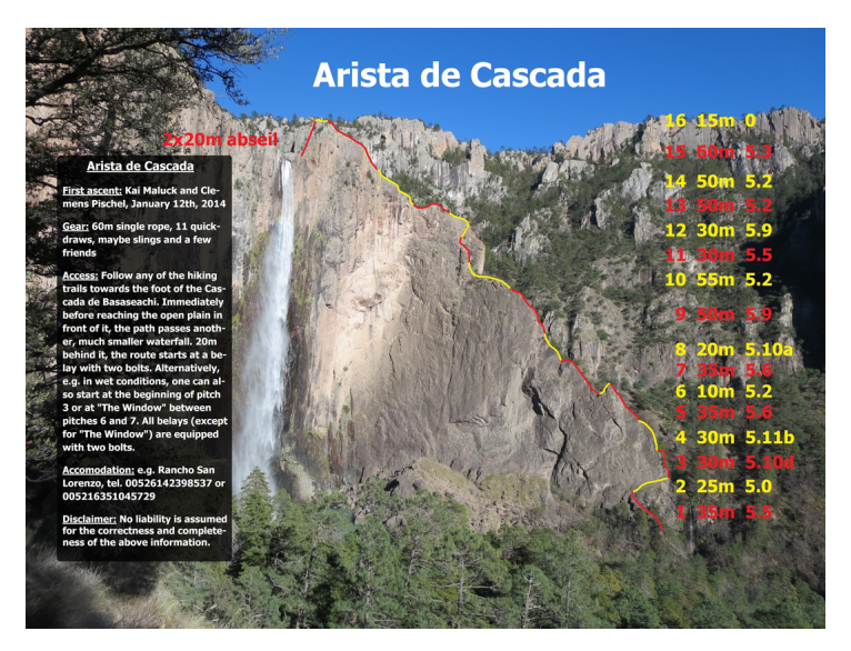
Topo for Arista de Cascada.