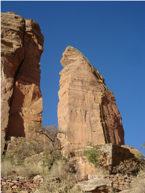
The new route on the Sharp One.