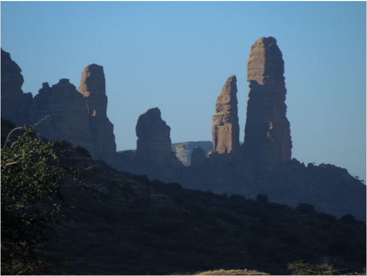
The Koraro Spires, from left to right: HCP, Squatty, Sharp One, and Sheba.