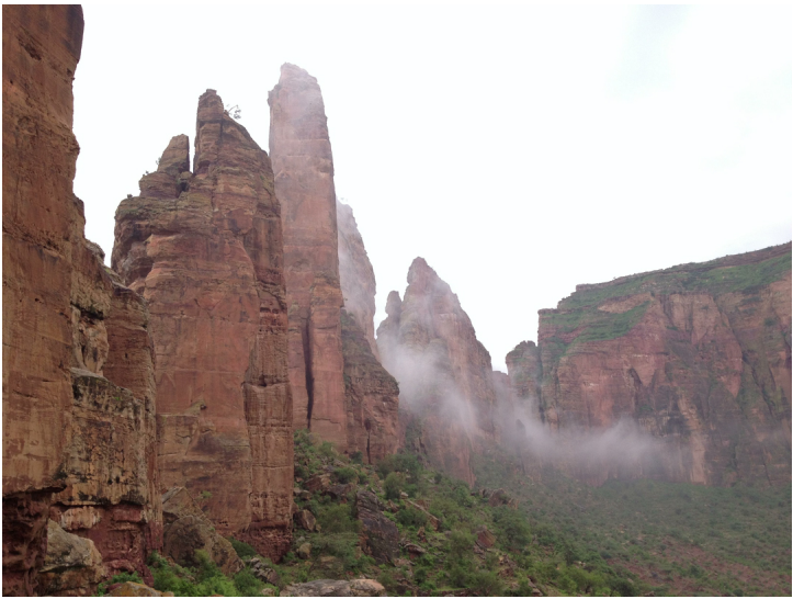
The Koraro Spires, enveloped in clouds during the wettest month of the year.