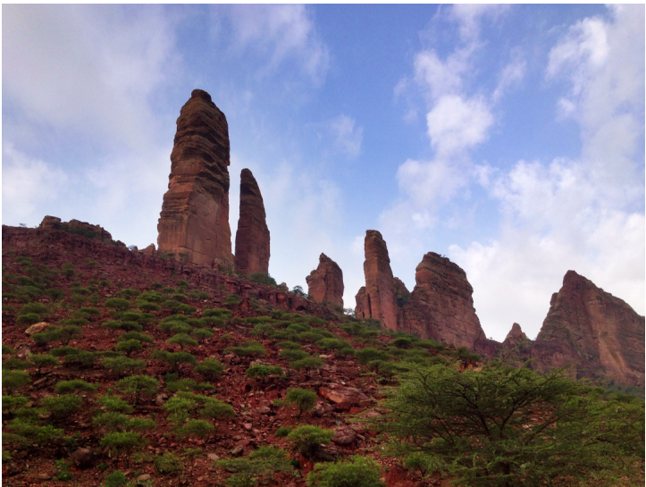
The view of the Koraro Spires from the base.