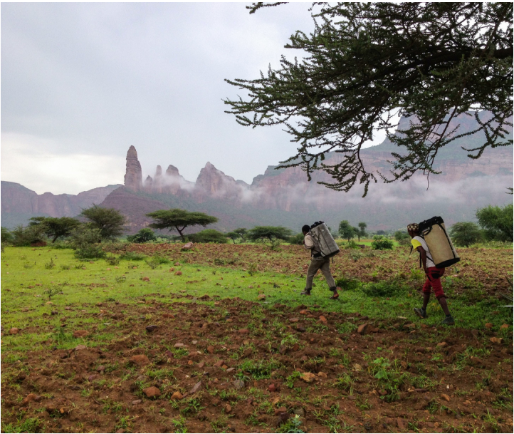
The locals help with the approach to the Koraro Spires.