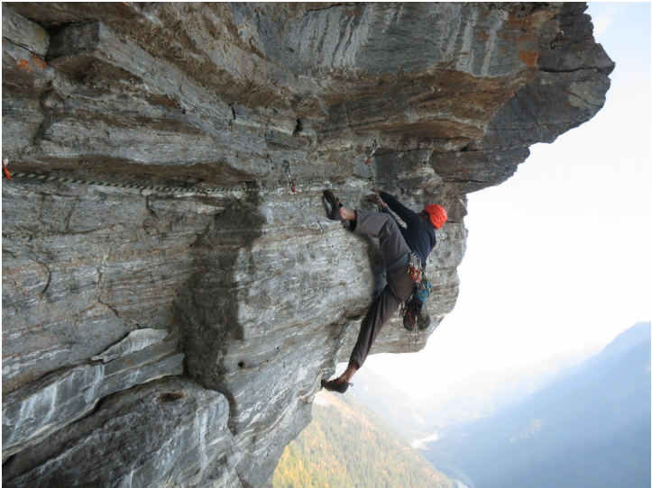
Leading under a steep roof on the Victor Lake Wall.