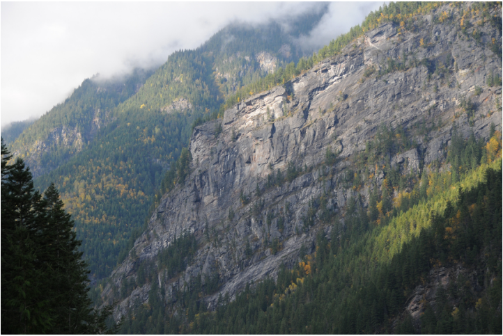
The Victor Lake Wall.