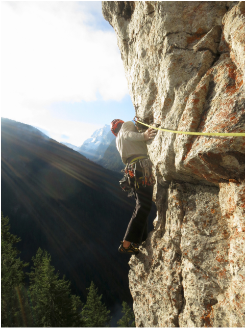
Pitch 6 of Grand Finale.