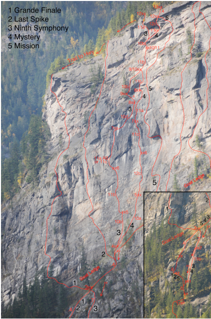
Top for Ninth Symphony and Mystery.