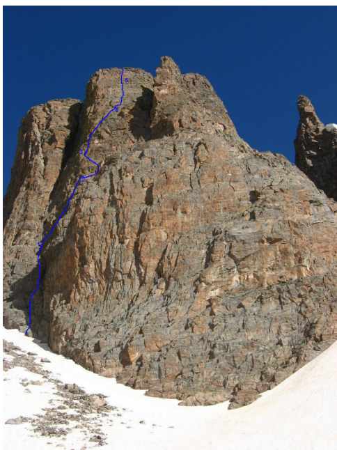
Photo topo of Reclusive Buttress.