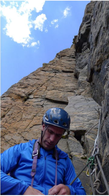
Looking up Outta Sight.