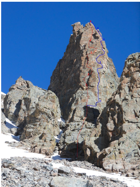
The Stiletto, showing Misericorde (left) and Shoe Fetish (right).