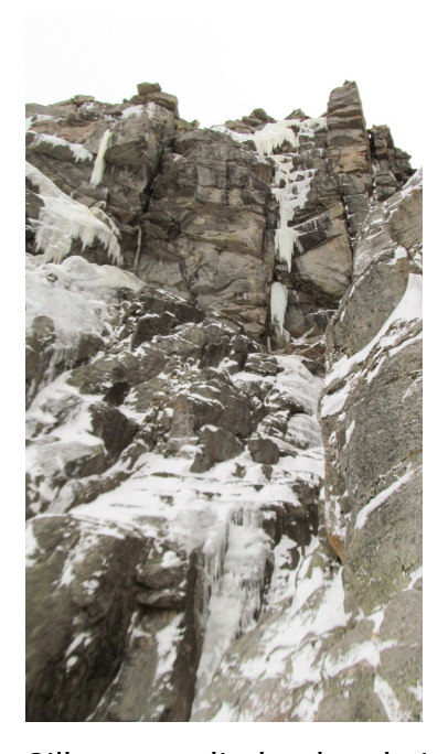
Silhouette climbs the obvious line of hanging ice daggers.