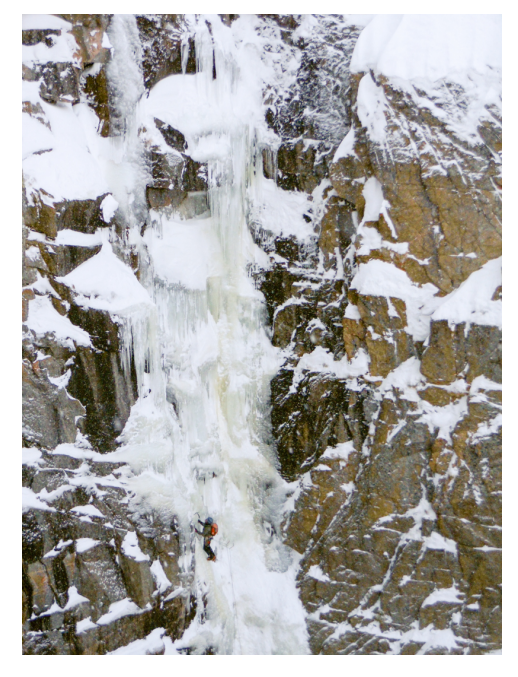
Final pitch of Black and White.