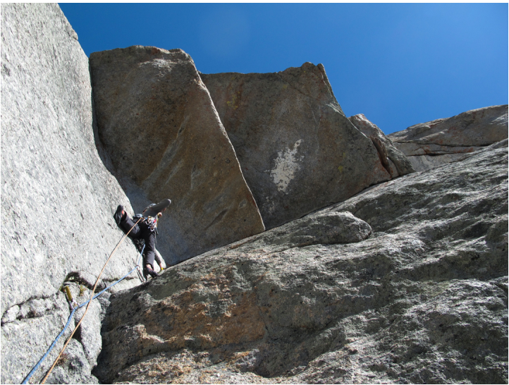
Looking up at the Wasichu Roof on the route Red Cloud.