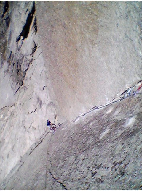
Looking down the Red Spear, a 5.12- tips corner.