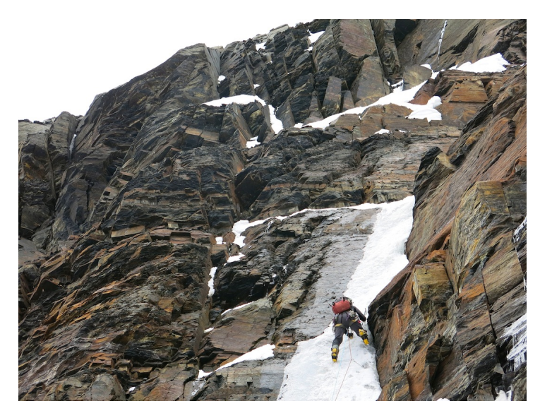
Gregg Beisly in the narrow ice runnel of Los Sospechosos de Siempre.