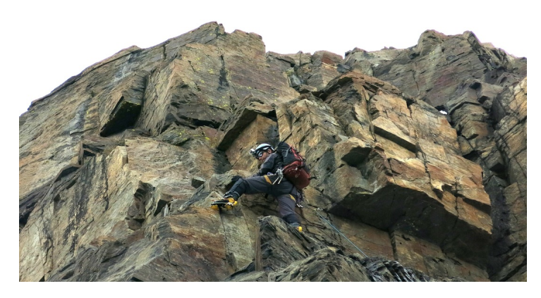
Gregg Beisly on the final rock section of Los Sospechosos de Siempre.