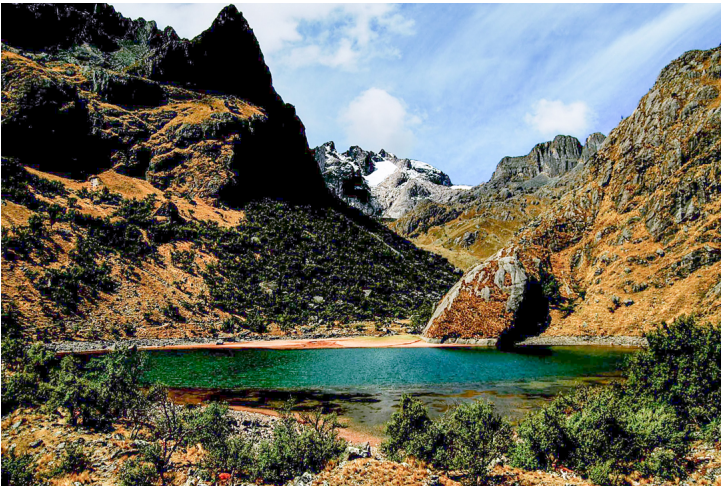
Looking up the approach valley from Laguna Manalyosec.