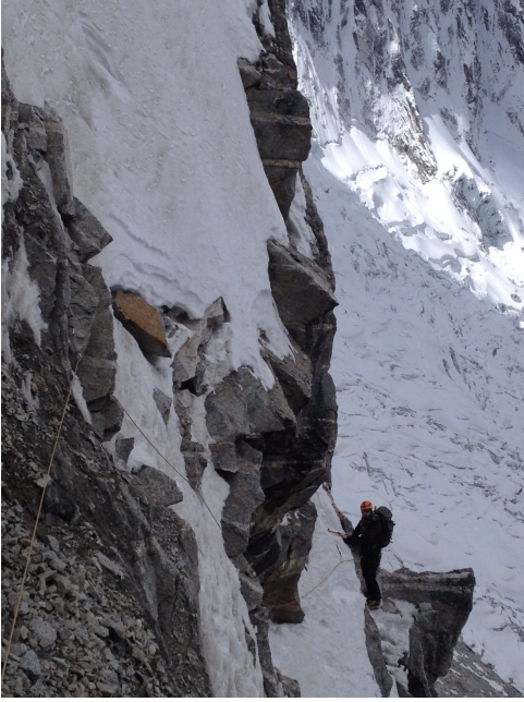
Mixed snow and rock lower on the climb.