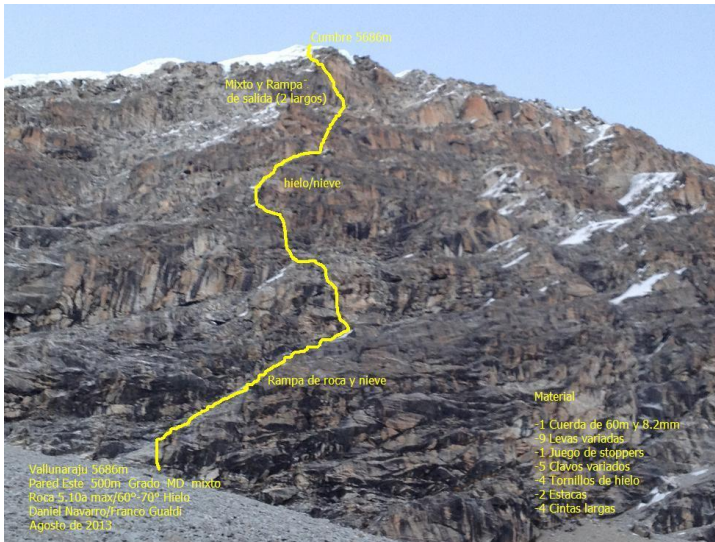
The east face of Vallunaraju showing the possible new route.