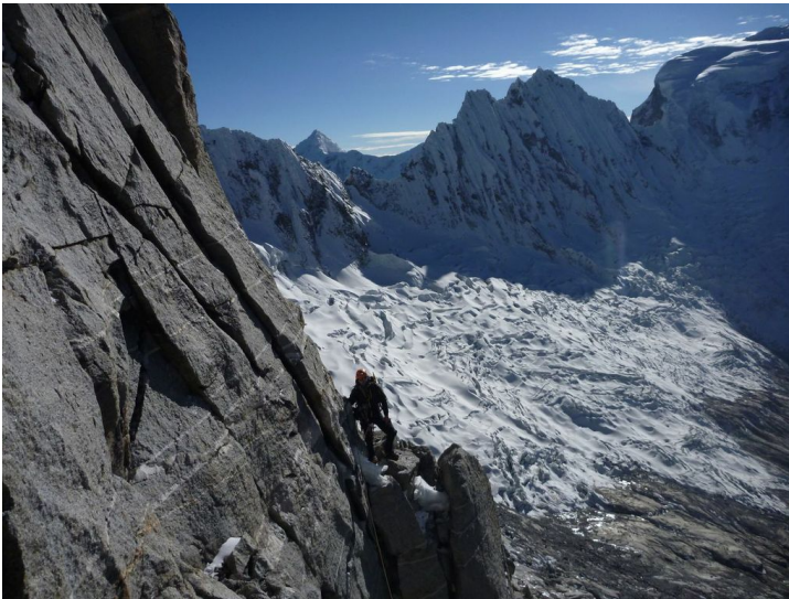
Climbing solid granite on the upper portion of the climb.