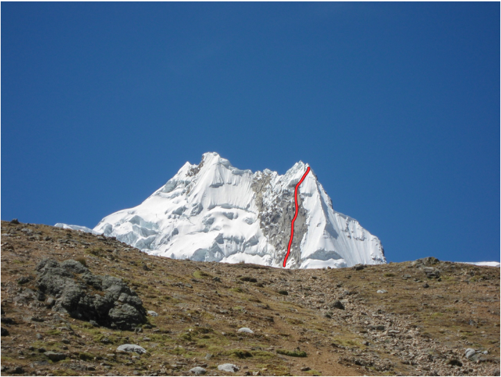
The west face of Shaqsha showing the mostly rock route Würmligrübler, which stops below the peak's southwestern summit (5,697m). The main summit (5,703m) lies to the left.