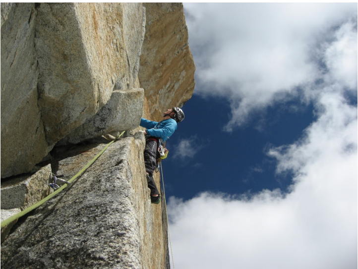
The final pitch of rock climbing before reaching the snow above.