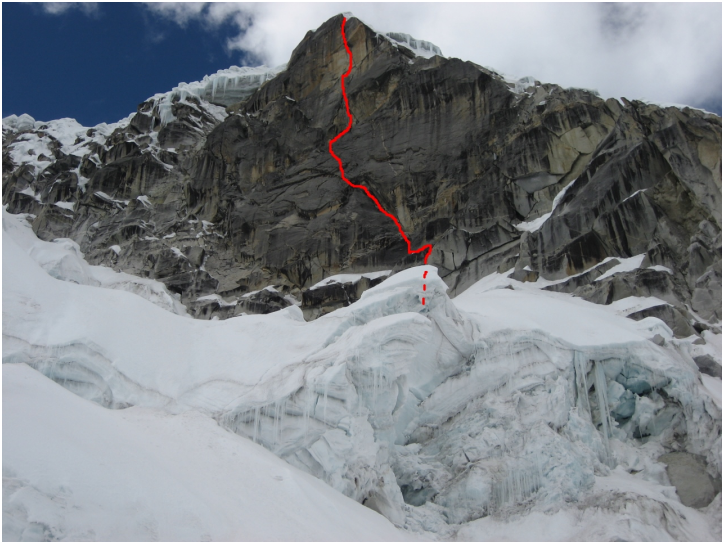
A close up of the new route