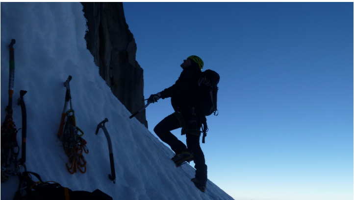
Dawn at the base of the climb