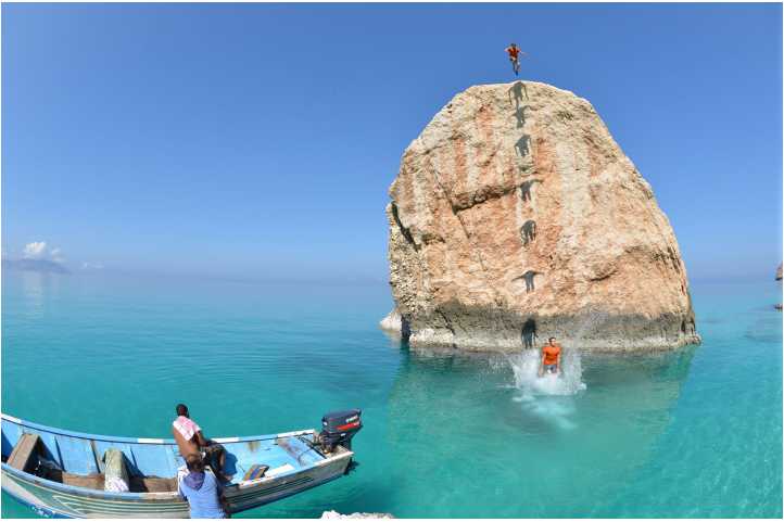
DWS in Yemen.