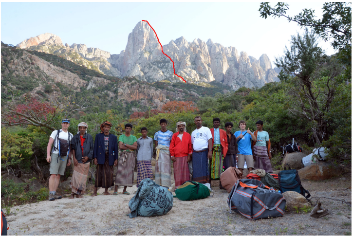
Thabbit's Tower, with the west ridge route marked.