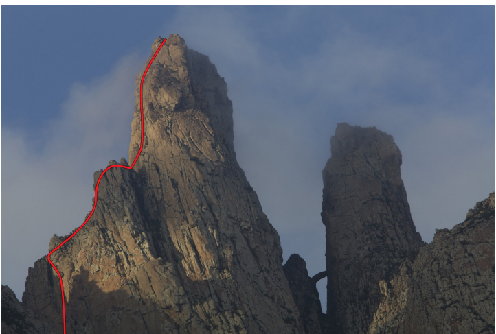
The Libeck-Pringle route on Mashanig's east side. North tower is on the right.