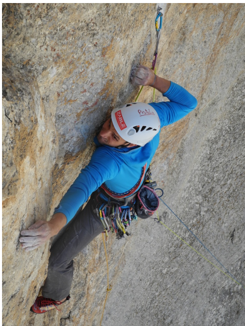
Climbing on Mostro Turco.