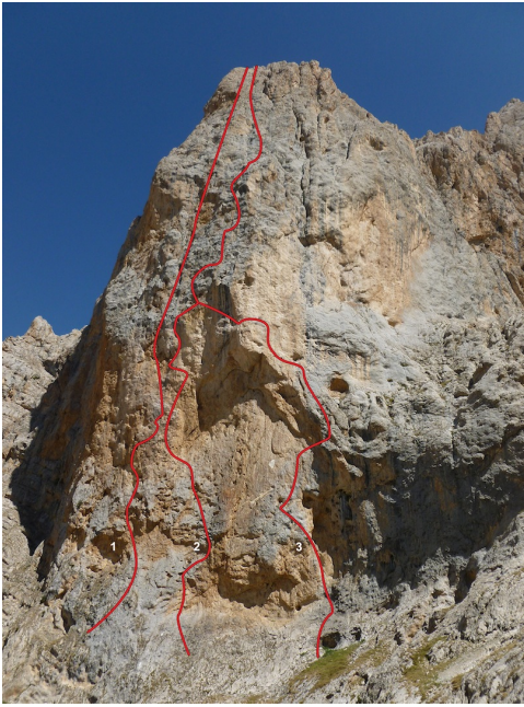
West face of Lower Guvercinlik: (1) Approximate line of Larcher-Oviglia, 2006. (2) Atomic Folder, 2013. (3) Mostro Turco, 2013.