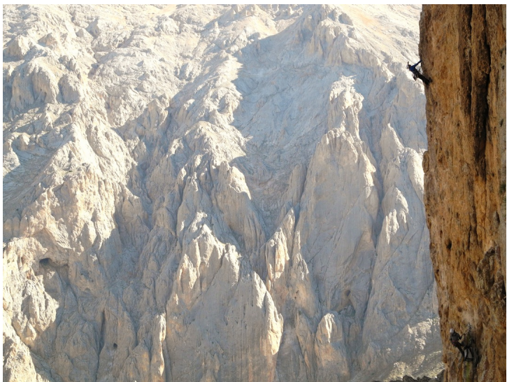
Climbers on Atomic Folder.