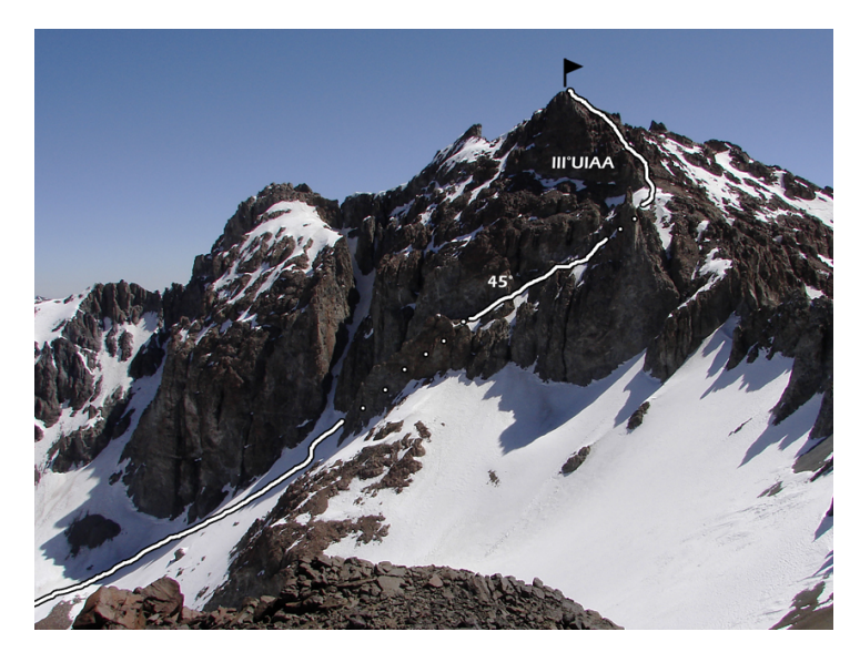
Pico Titán, east face.