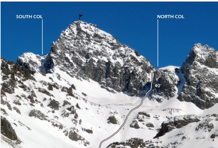
Caracoles east face.