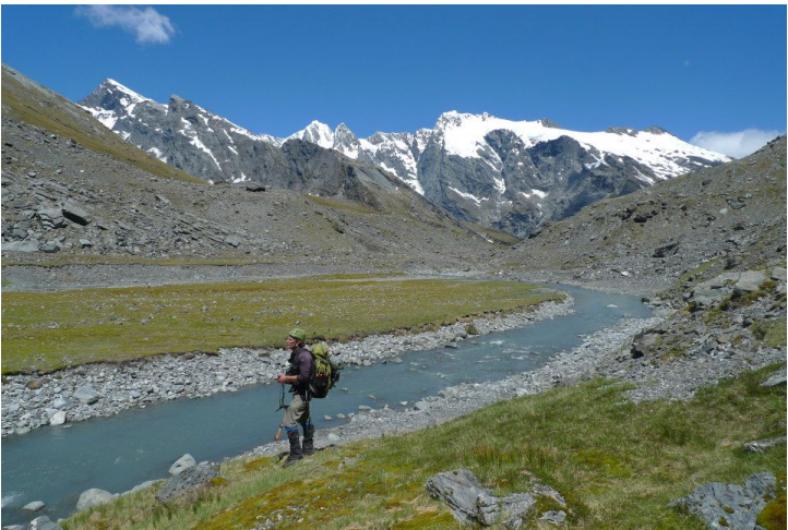
The upper Landsborough Valley, en route to Mt. Burns.