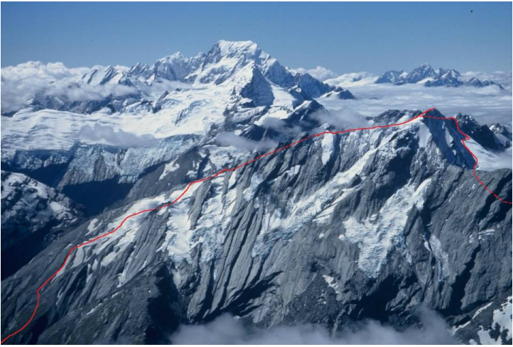
The northwest ridge of Mt. Burns. Aoraki / Mt. Cook is the largest peak in the background.