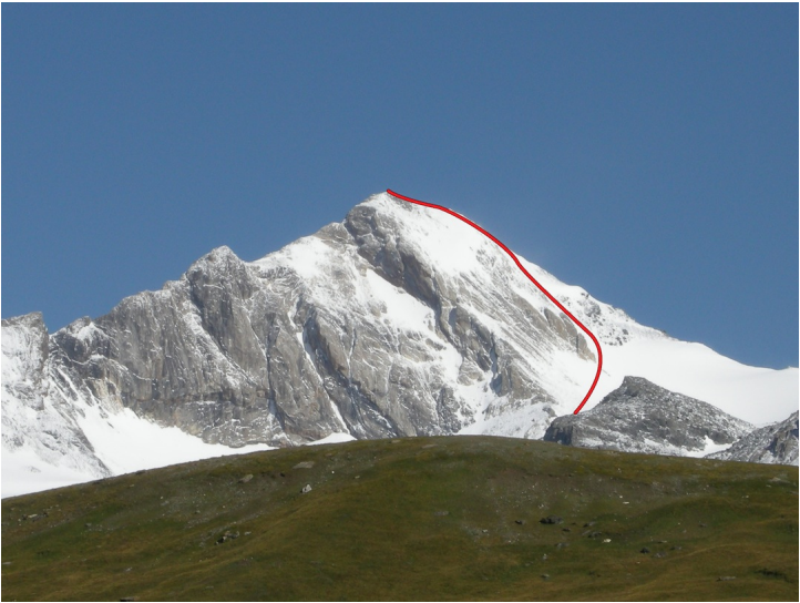
Peak Katushka with the line of the first ascent.