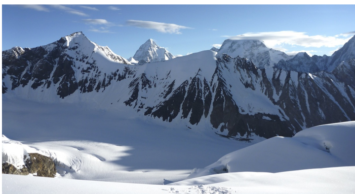
Looking north from the Gondokhoro La (high resolution reference).