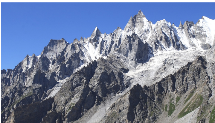
Spires on the western side of the upper Gondokhoro Glacier.