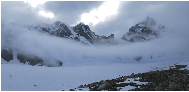
Looking up the West Vigne Glacier to its top left corner. The highest peak visible (6,170m) is most likely the true lhakora, climbed in 1955.