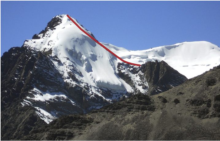
Apolobambab Matchu Suchi