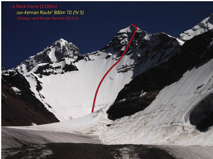
Rock Horse, showing the 2012 route (TD) on the northwest face. The peak had been climbed twice before.