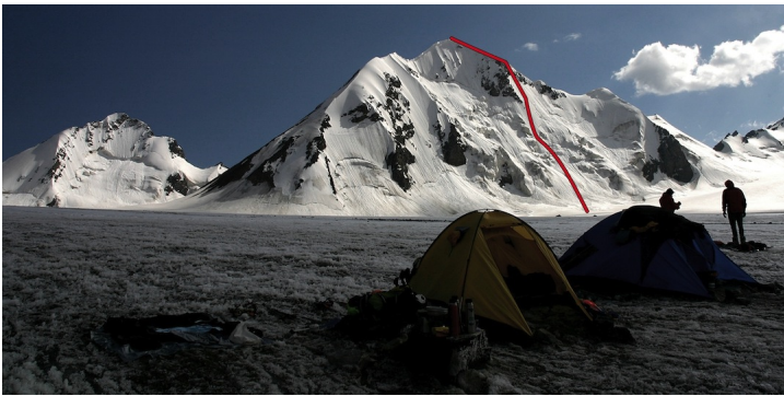
North face of Nochnoi Motyl, showing the North Face Corridor (2012). Peak to the left is Uighur.