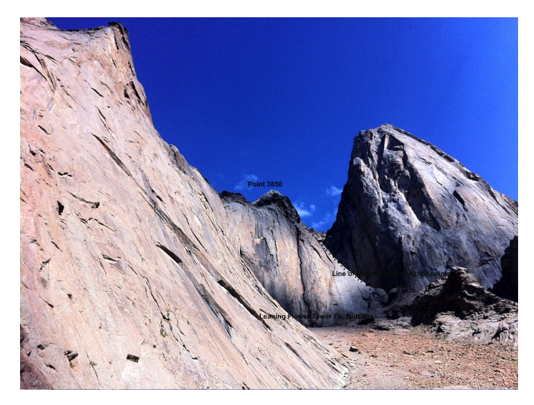
Leaning Flower Tower (5 pitches, 7b) on the central pillar of Peak 3,850m.