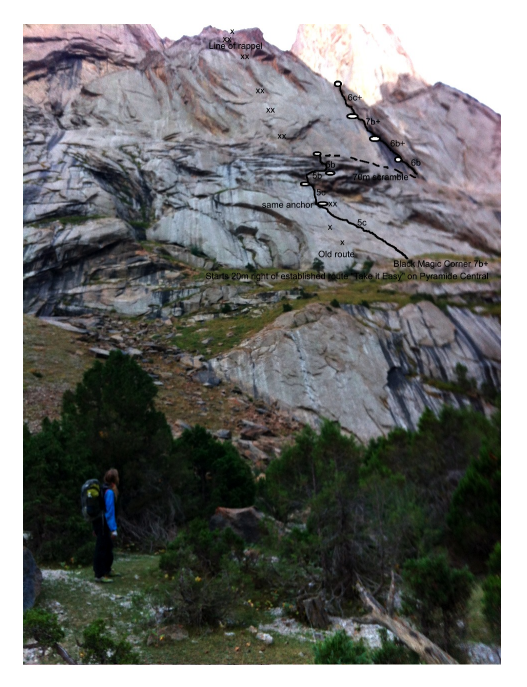
Black Magic Corner (7b+) on Peak 3,850m.