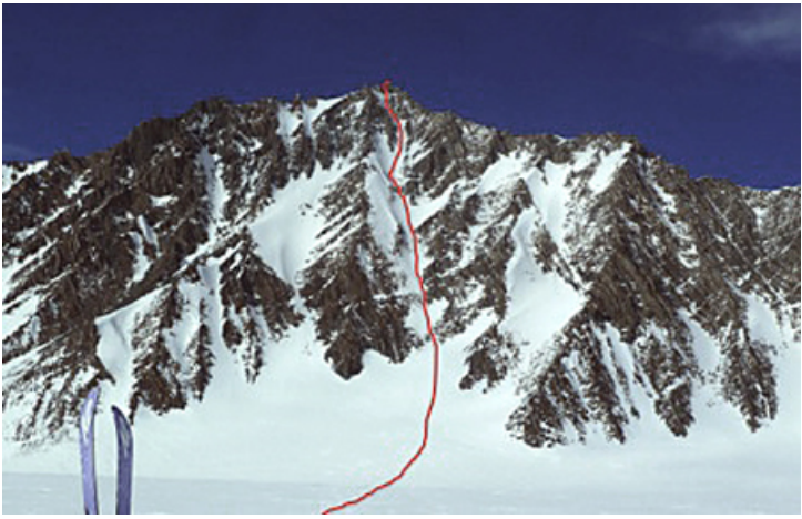
The north face of Liptak. The first ascent route finished up a summit ridge of loose rock.