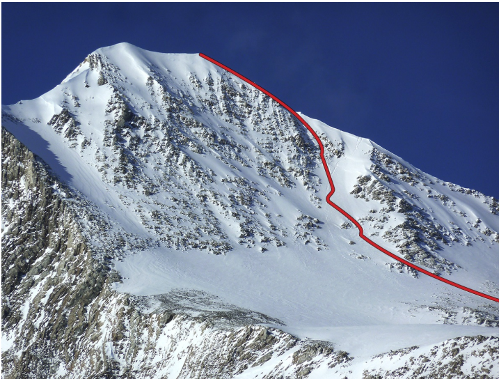
The south face of Allen. The first ascent route finished up the corniced southeast ridge.