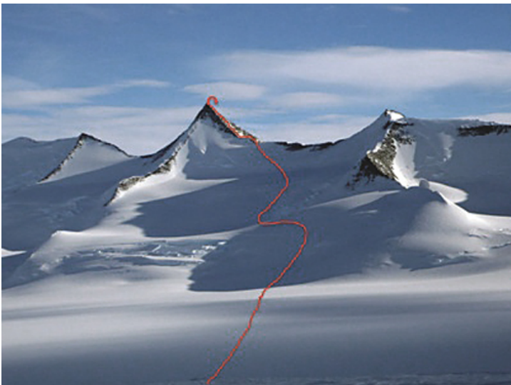
Robinson from the west, showing route of ascent on the south ridge. The first ascent party went down the far side (northeast ridge) and then had to climb back over the col.