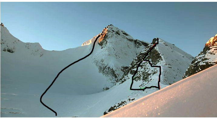
Near at Hand (left) to the summit of Duochubomubadeng (5,466m); Miss Zhu's First Ascent (right, two different starts) to the summit of Peak 5,288m.