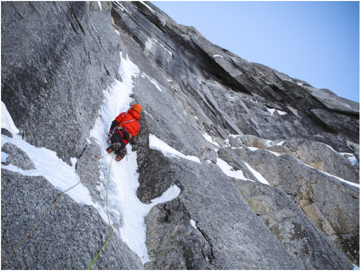
Christophe Dumarest climbing thin ice smears during the first ascent of Largo's Route.