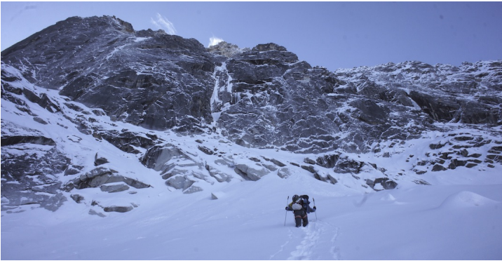
Damien Tomasi breaking trail in the initial gully. The crux ice pitch is immediately above.