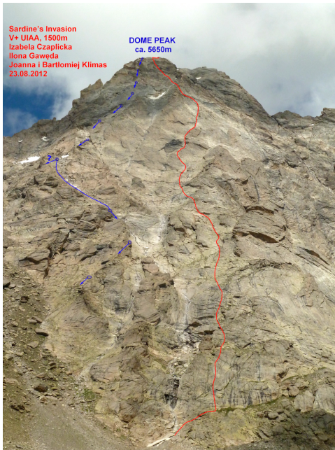
Southeast face of Dome Peak. The red line is Sardine's Invasion, the blue the rappel descent.