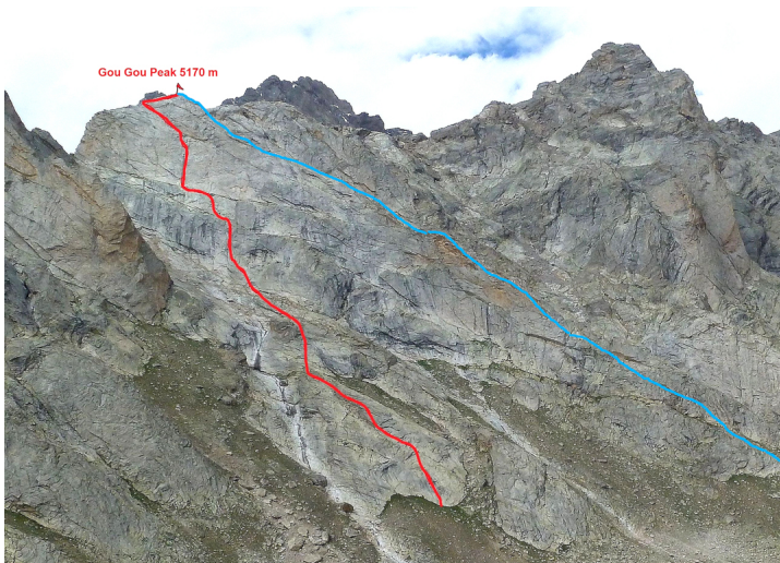
Southeast face of Gou Gou Peak. The red line is Happy Couple on Holidays, the blue Gou Gou Ridge.