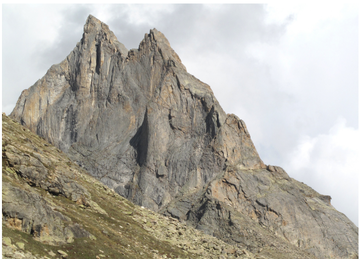
Northwest face of Castle Peak.