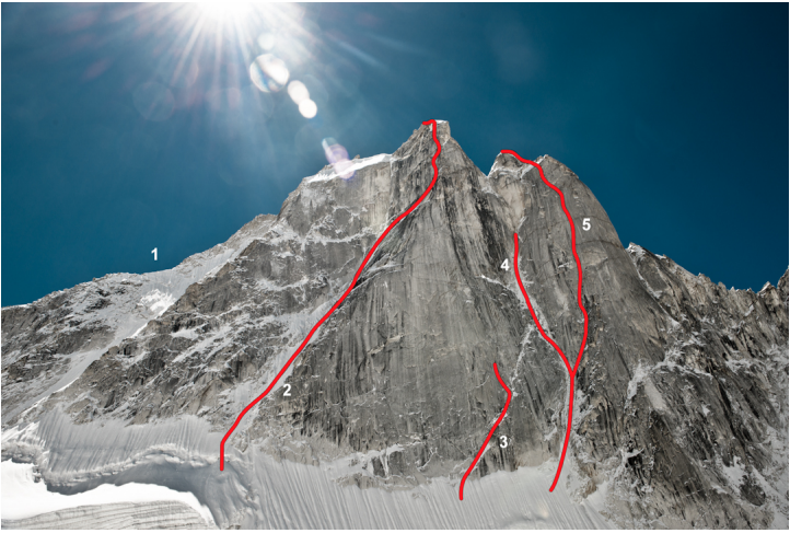
The north face of Arwa Spire. (1) East Ridge (first ascent). (2) Fior di Vite. (3) 2000 Cool-Parnell attempt. (4) 2000 Powell-Wills attempt. (5) Capisco.