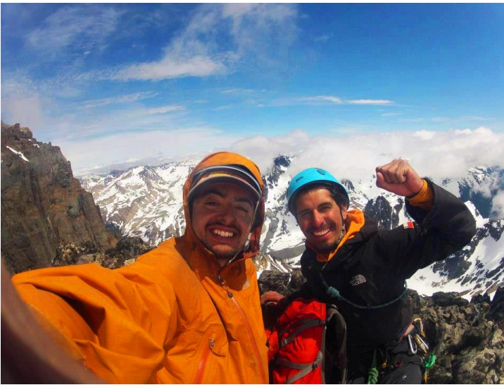
On the summit of Torreón Chala.