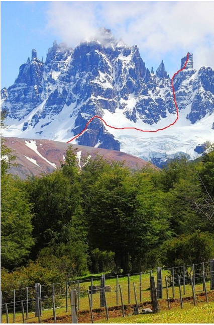
The route up Torreón Chala in the Cerro Castillo.