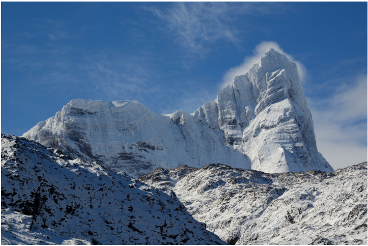
An overview of Monte Giadorno.