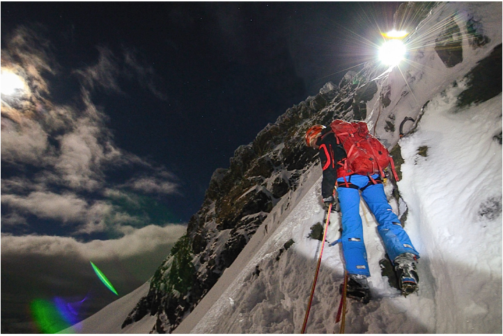
Robert Jasper rappelling in the dark after a short weather window allowed the team to make a rapid ascent of Monte Giordano's west ridge.