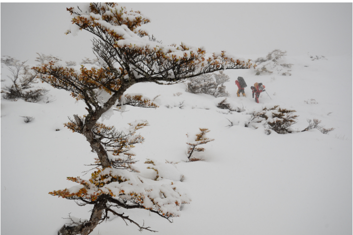
A stormy approach to Monte Giordano.