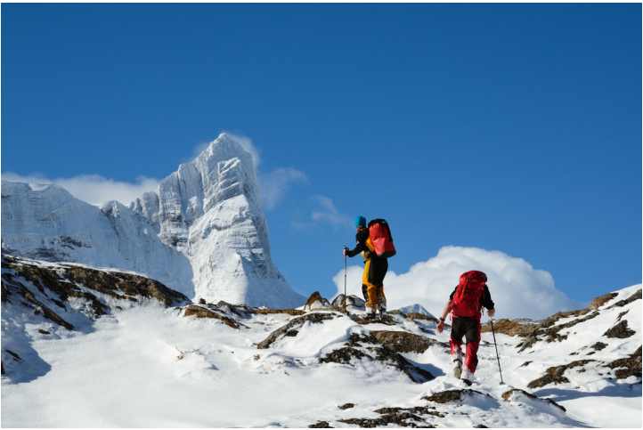
Approaching Monte Giordano's west ridge (the Shark's Fin Ridge), the obvious sweeping ridge line to the left.