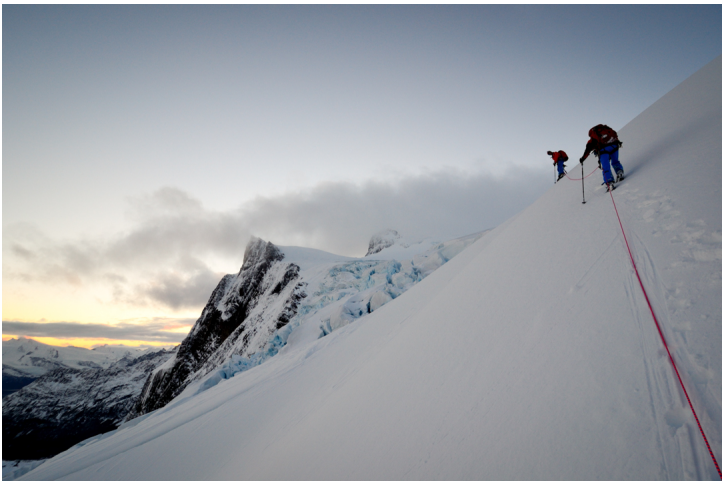
Traversing along the ridge.