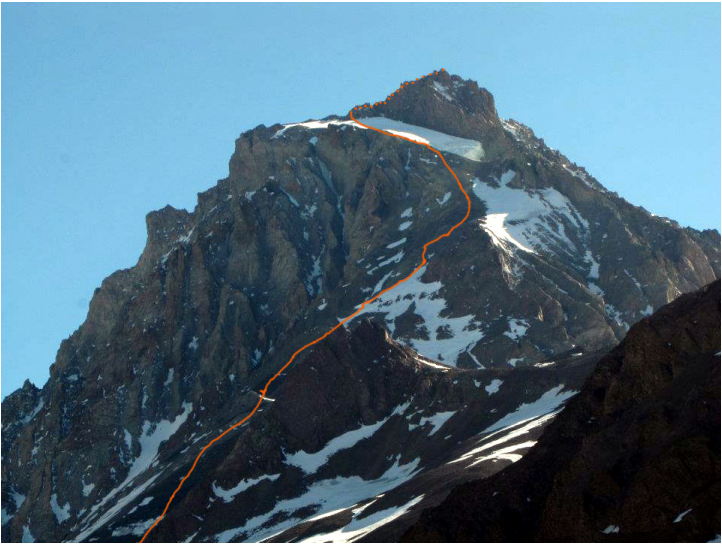
The route up Cerro Panamericano.