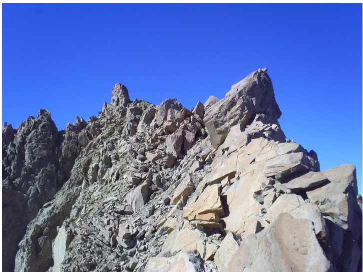
The broken upper ridge.