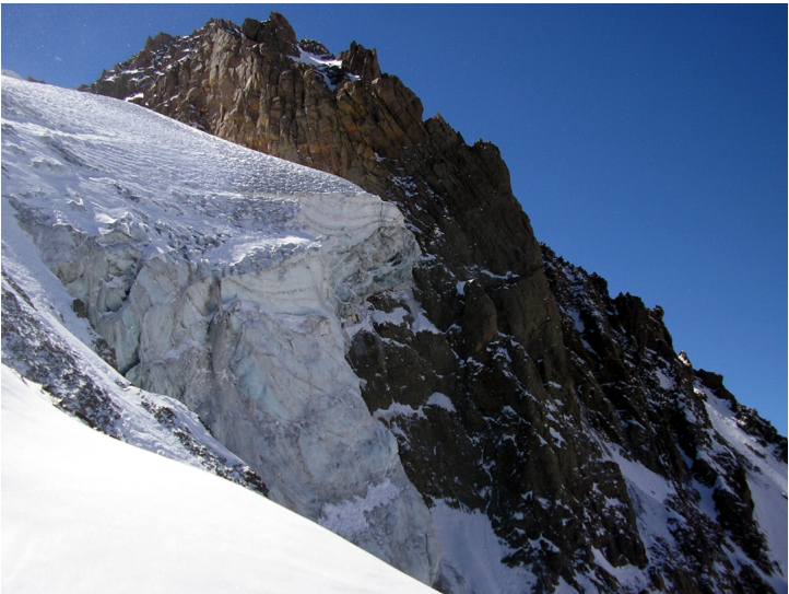
Hanging glacier on Cerro Panamericano.