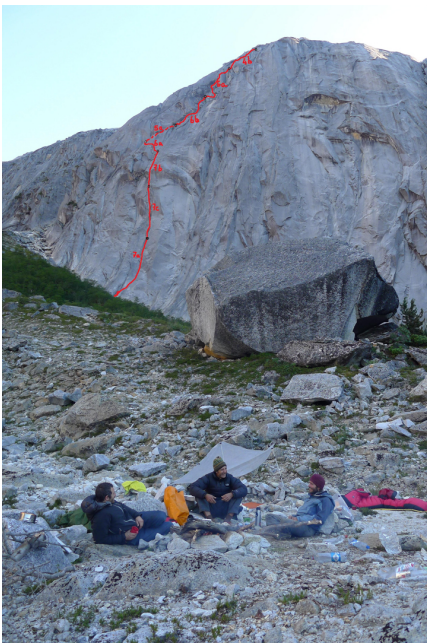
A pitch-by-pitch breakdown with suggested grades, though the team did not free the first three pitches. The route is now clean and ready for a free attempt by a strong party.