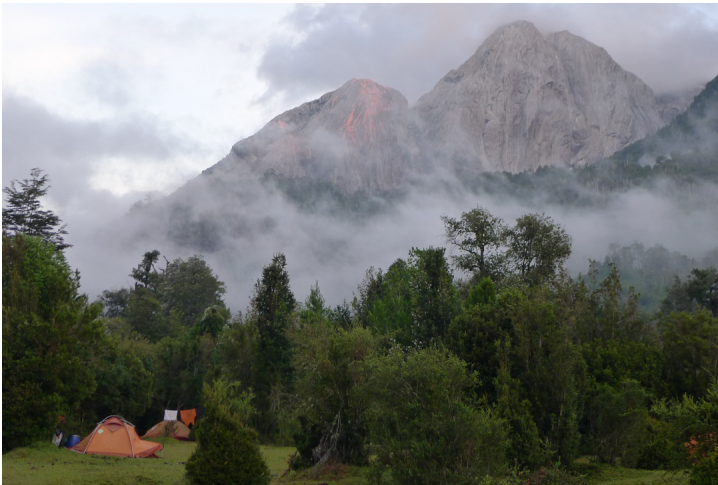
Pared La Paz is the feature on the left.