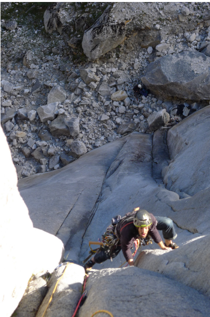
Steep and thin cracks low on A Poto Pelao Po.