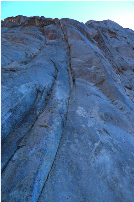
Looking up the first portion of the route.