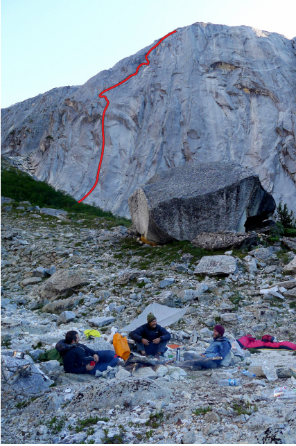
A Poto Pelao Po on Pared La Paz.