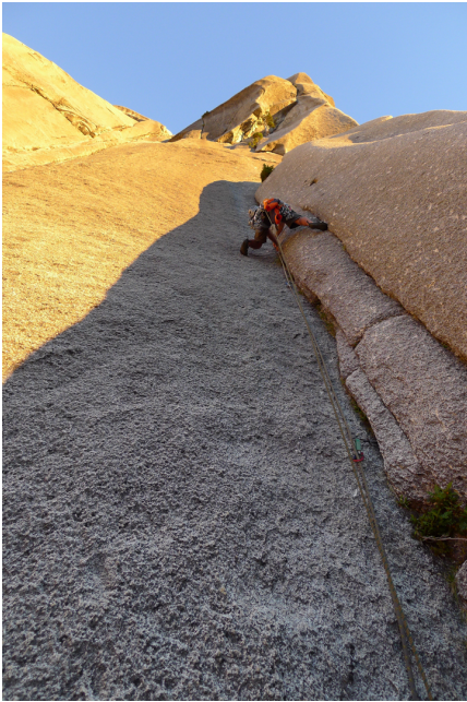
Steep crack climbing on featured granite.