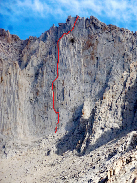
A new route on Mt. Russell's southeast face, at an accessible length and grade.