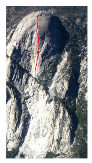
Astro-Gil on Tehipite Dome.