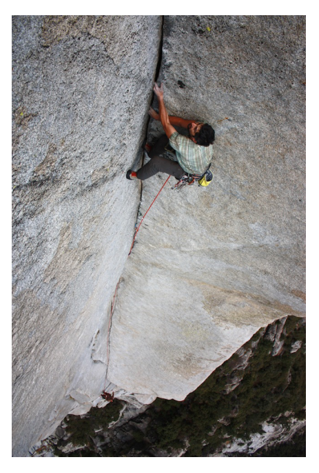
Shaun Reed leading the fourth pitch of Astro-Gil, a new 11-pitch 5.11 route on Tehipite Dome.