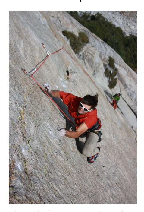
Thin climbing on Pitch 7, The Honey Badger Traverse.