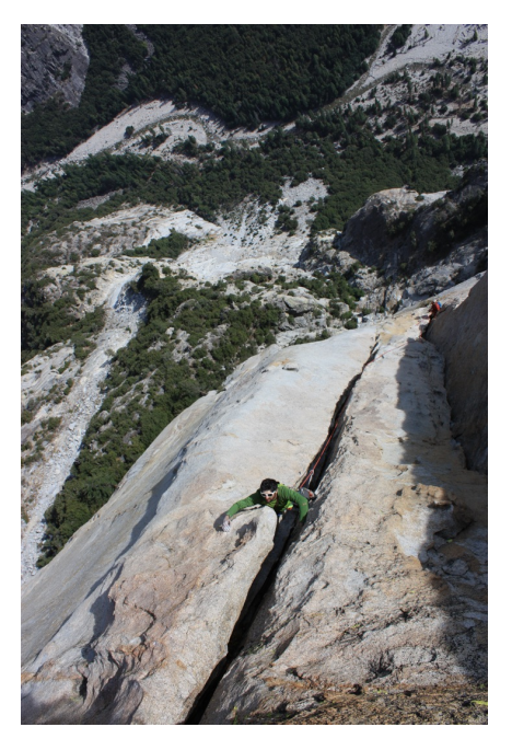
Reed leading up a long crack as the exposure grows.