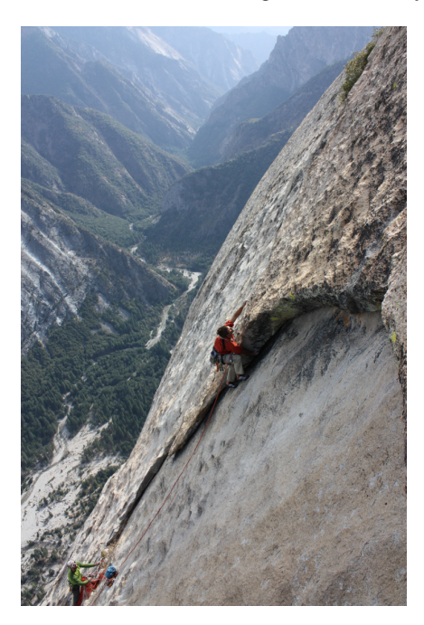
Wilson climbing up featured rock.