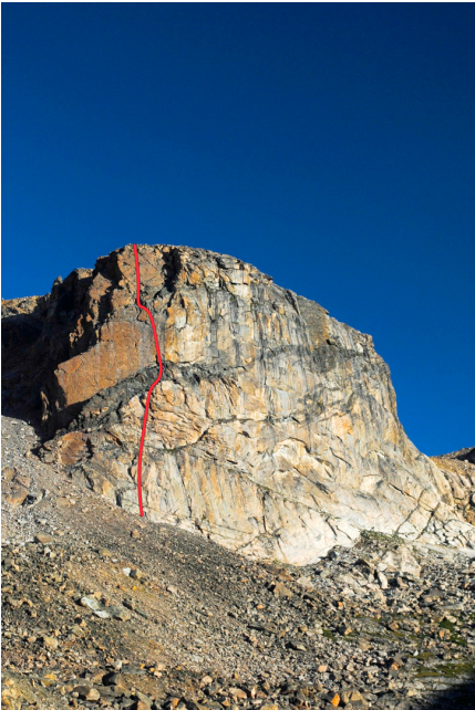
Classy Girls on the Hairpin Brow Butte, Absaroka-Beartooth Wilderness Area. It's the first route known route on the wall, with plenty of potential remaining.