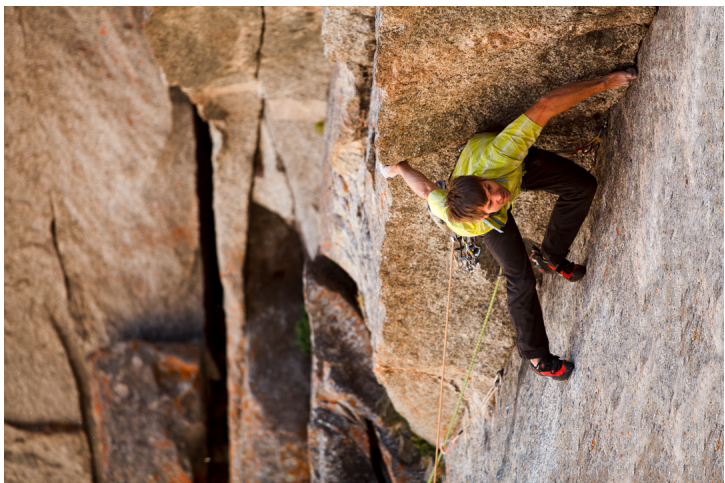
Wilson cops a rest on Pitch 1 (5.11).