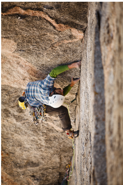
Reed laybacking on Pitch 2 (5.11+).