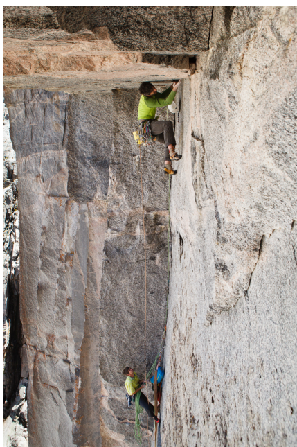
Reed underclinging Pitch 3 (5.11).