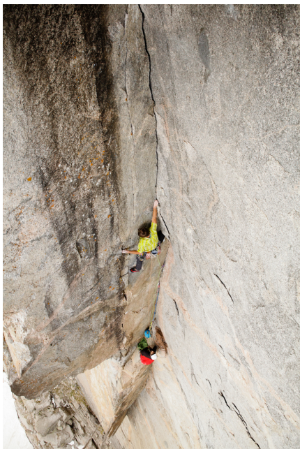
Wilson leading Pitch 5 (5.11+).