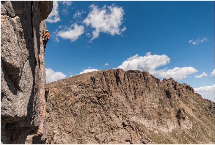
The Tan Buttresses are in the background.