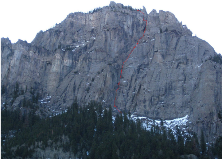
The new route Tasty Talks, downriver from the Ribbon.