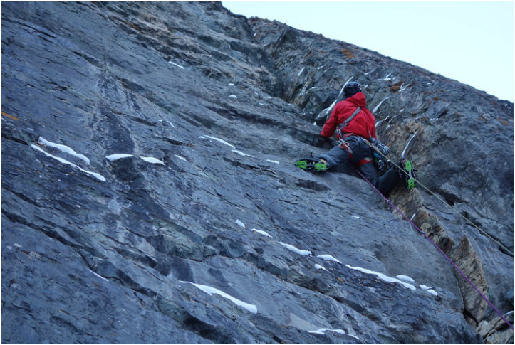
Kennedy leading on Pitch 4 of the House-Kennedy Chimney.