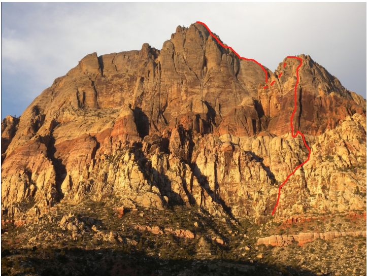
Blood on the Tracks and Cactus Connection route line.