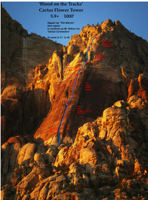
Blood on the Tracks topo.