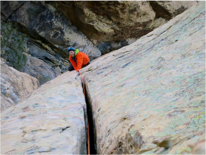
Chris Weidner following a splitter hand crack on Blood on the Tracks.