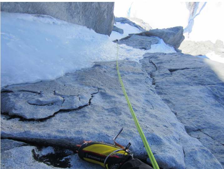
A solid gully near the top of Mt. Tiedemann.