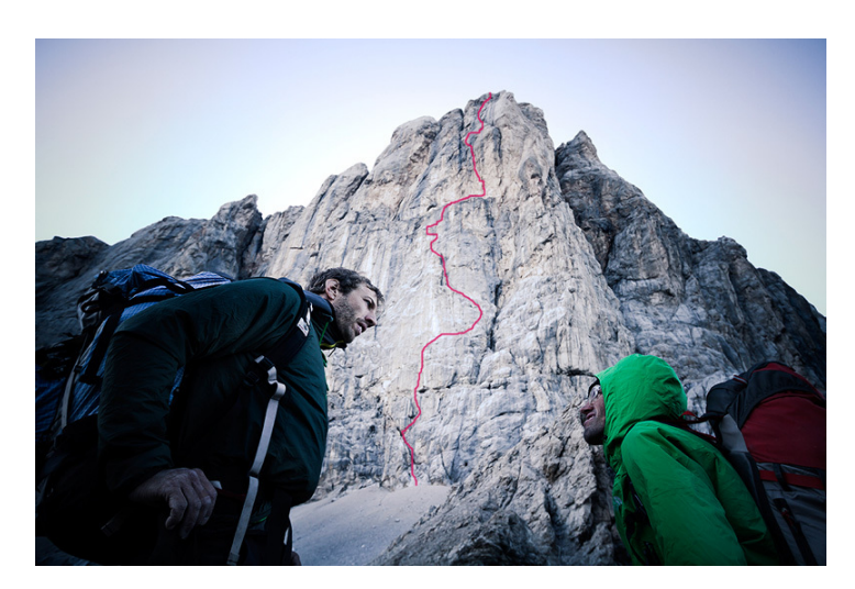
The line of L'ultimo dei Paracadutisti on Marmolada di Penia.