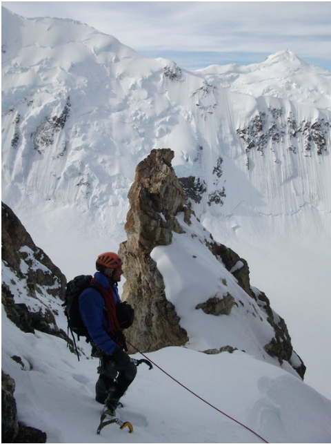
Snowy mountains in this remote part of the St. Elias.