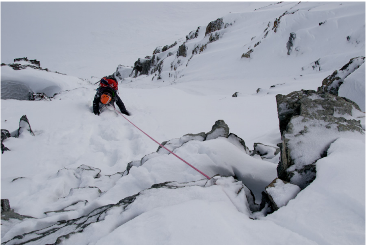
Typical terrain on the harder routes climbed.