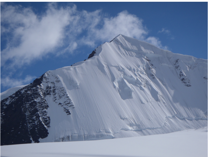
Mount Short, one of the most prominent peaks in the area.