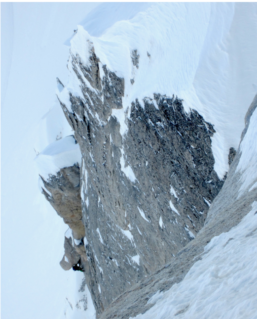
Steep, snowy corner mid-route.