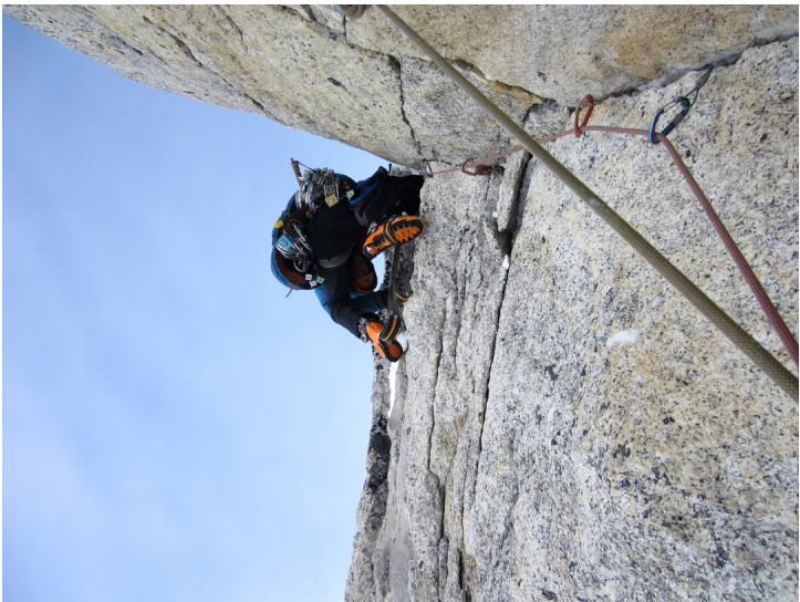
Turner aiding a steep crack.