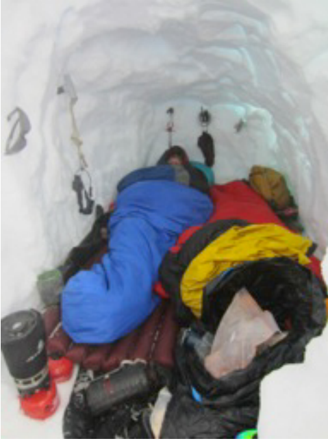
Snow cave bivy on Middle Triple.