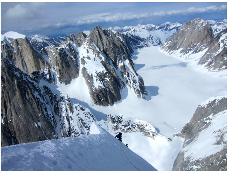
The upper snow ridge on Middle Triple Peak.