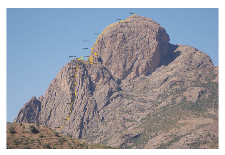
The line of Costa Brava (850m, 8a) on Samayata. The crux pitch is just above the midway ledge system.