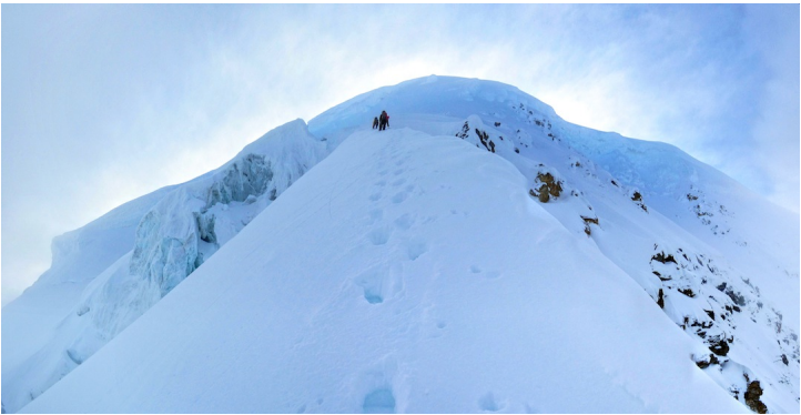
The upper exposed snow ridge.