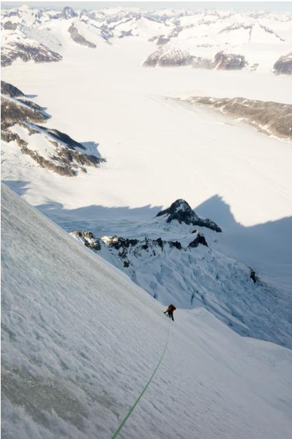
John Frieh following moderate ice slopes low on the face.