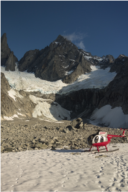
The smash-and-grab approach vehicle of choice. The new route ascends the unseen side of Mt. Burkett.