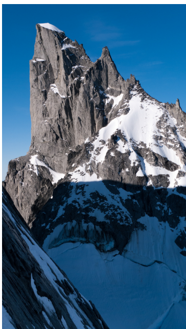
Burkett Needle, as seen from Mt. Burkett.