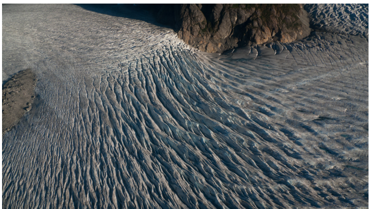
Flying above the Burkett Glacier.