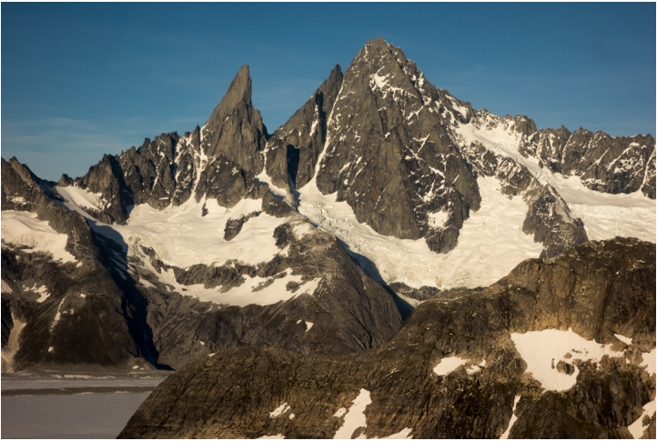
Burkett Needle (left) and Mt. Burkett (right).